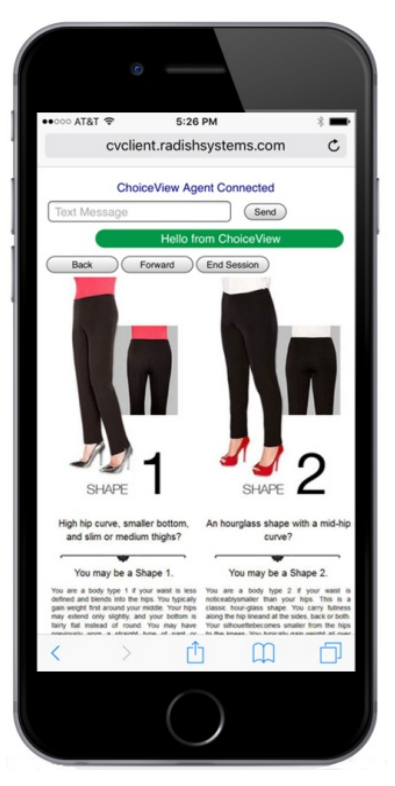
Sees sizes/shapes, asks questions, gets answers, finds best fit. Places order.