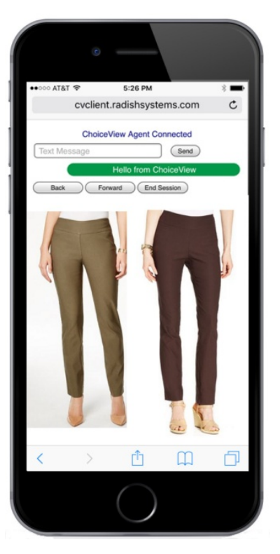
CSR sends more colors. Buyer adds more to order.

ChoiceView adds visuals to voice / text calls with e-Retailers. Buyers see and hear at the same time.